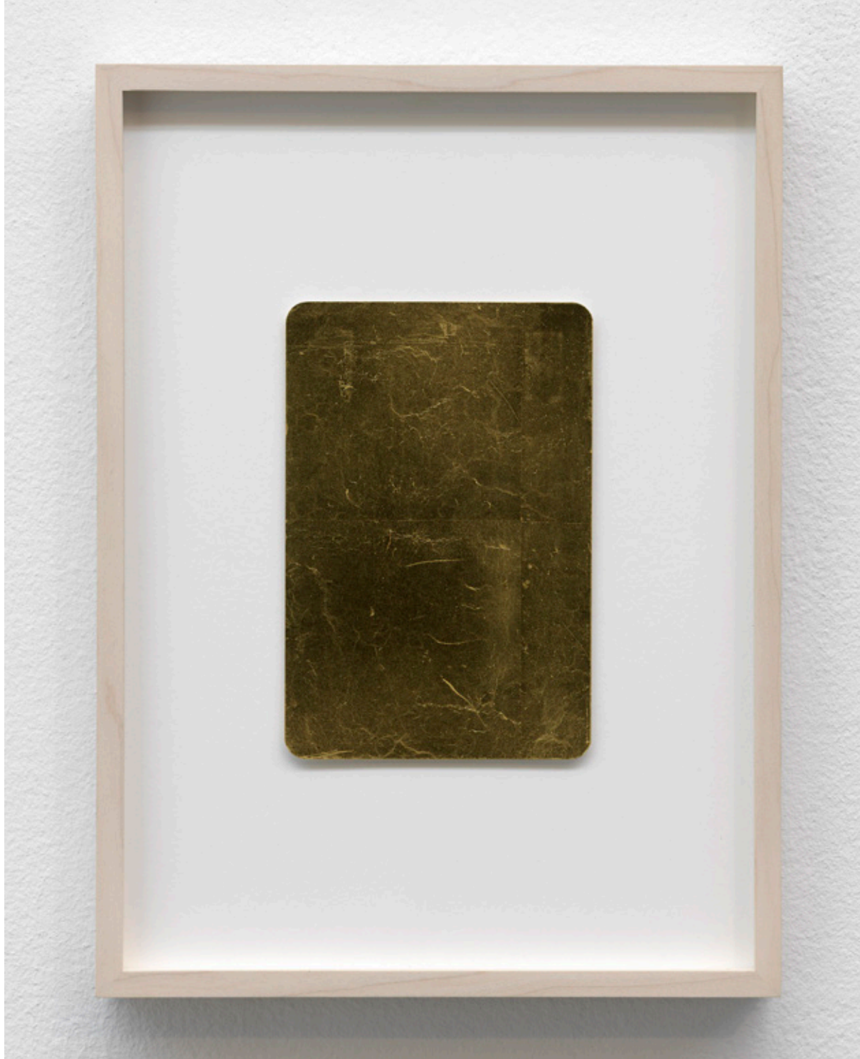
Golden Memories , 2015, 4,30g, old photograph, 24-carat gold leaf, 10x15cm. / A photograph from the artist's childhood is covered with gold leaf. The past memory is no longer accessible, and instead mirrors the present reality.