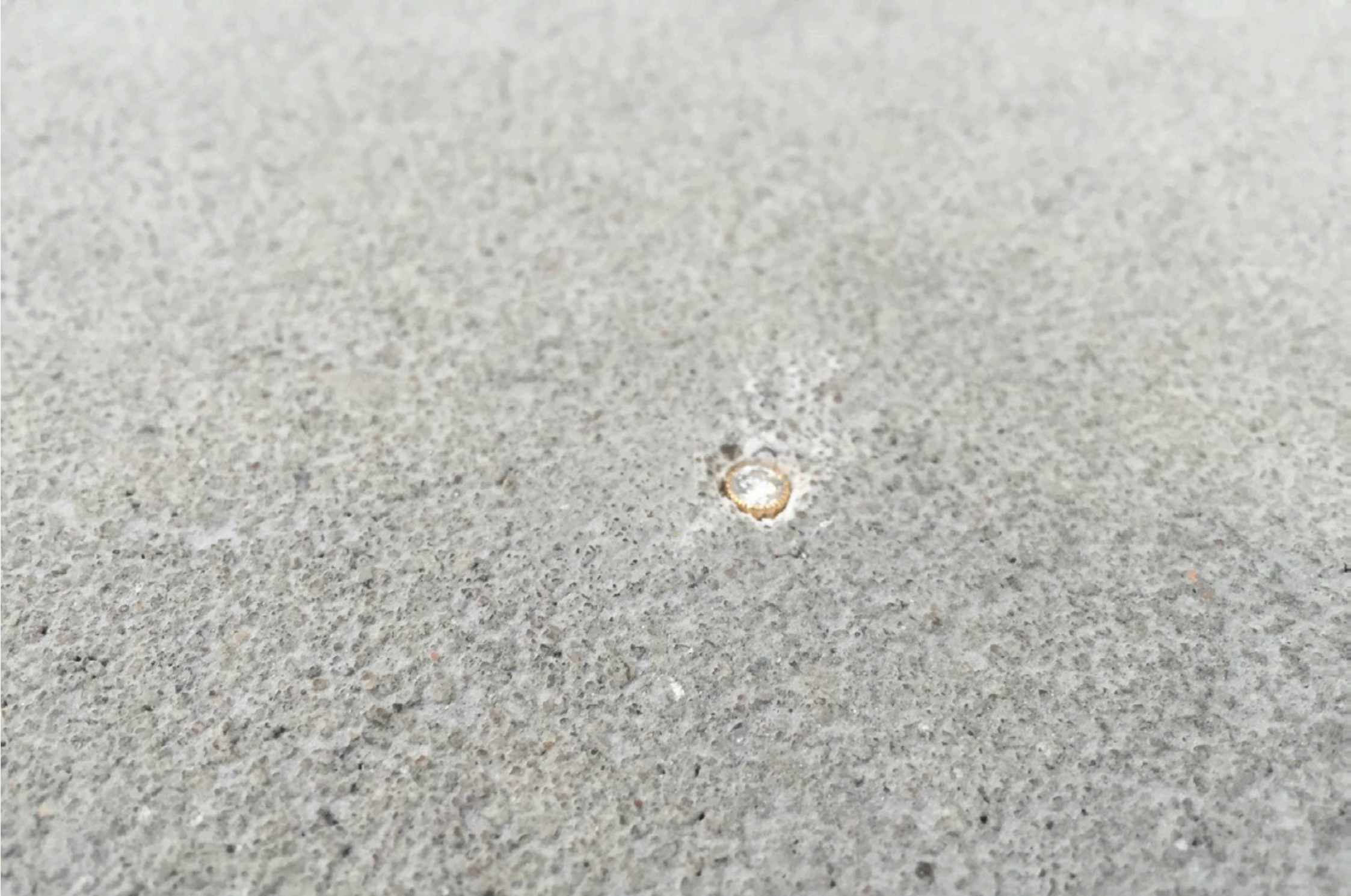
Thin Ice, 2015, real diamond, gold mount, 0,36g. / A real diamond is inserted somewhere in the floor of the gallery. People walk on it inadvertently.