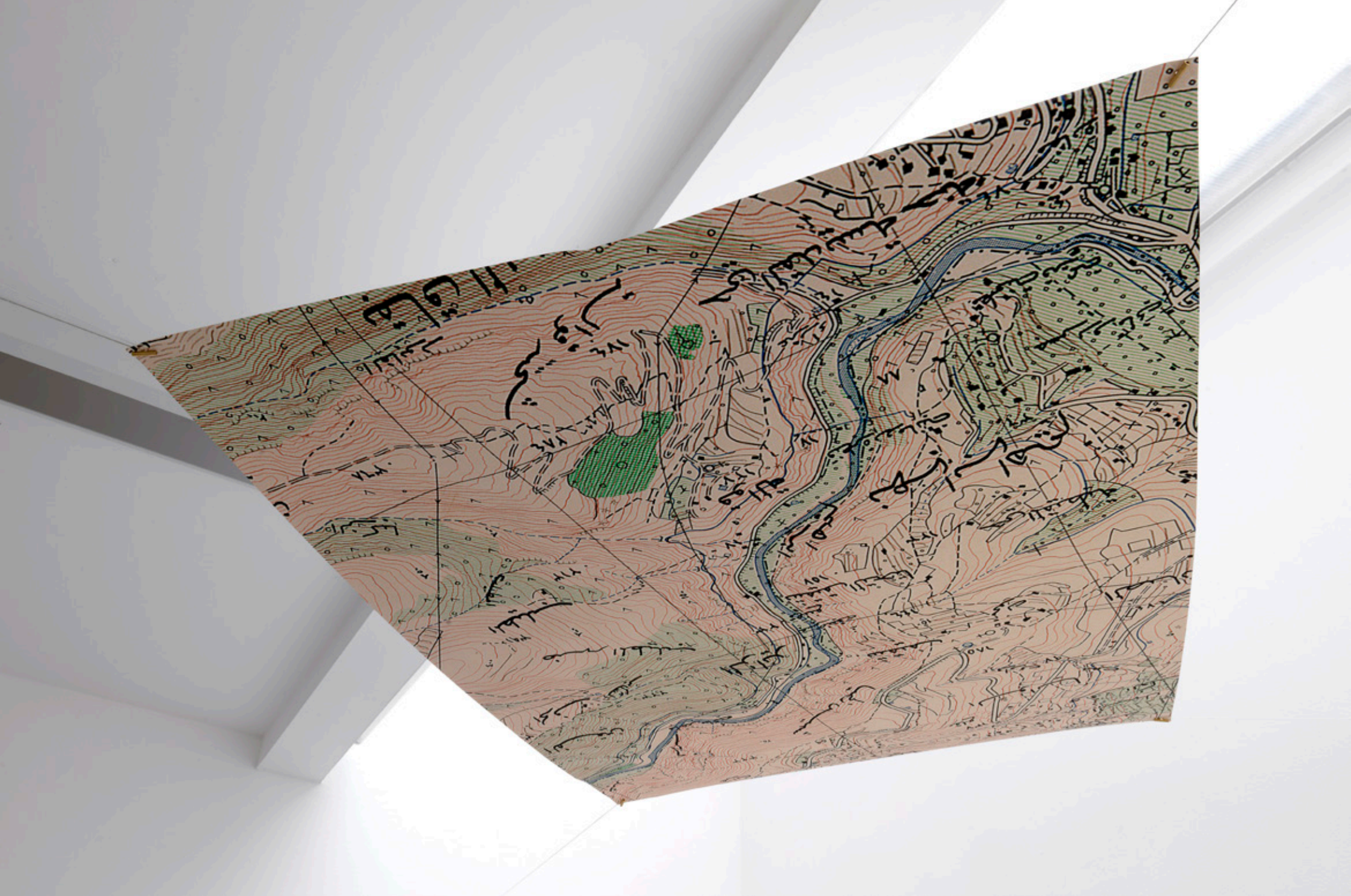
Portrait of a River, 2016, 496g, printed map, waterproof varnish, 112x150cm. / A map of a part of Lebanon is rendered waterproof, at the exception of the river showing on it. Water is poured on the top of the map and drips through the Lebanese river onto the floor of the gallery.