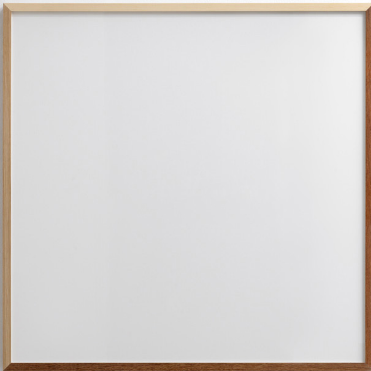
The Four Corners of the World , 2015-2016, 7.000g, frame, 90x90cm. / A frame is composed of four woods coming from the North, the South, the East and the West of the world. Inside the frame, left empty, an image of the world appears.