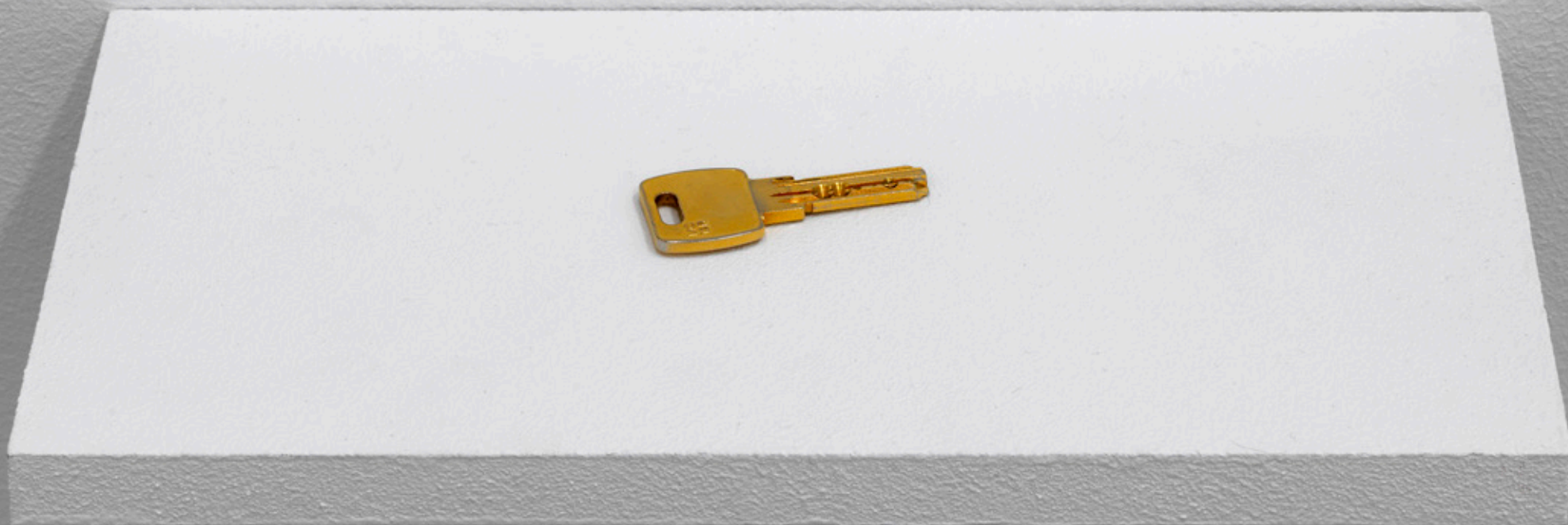
Home Key , 2016, gold plated key, 6x2,5x0,2cm. / The key of the home of the artist in Beirut is plated with gold. The occurrences of leaving and returning home are registered in the material of the key as the gold slowly wears off.