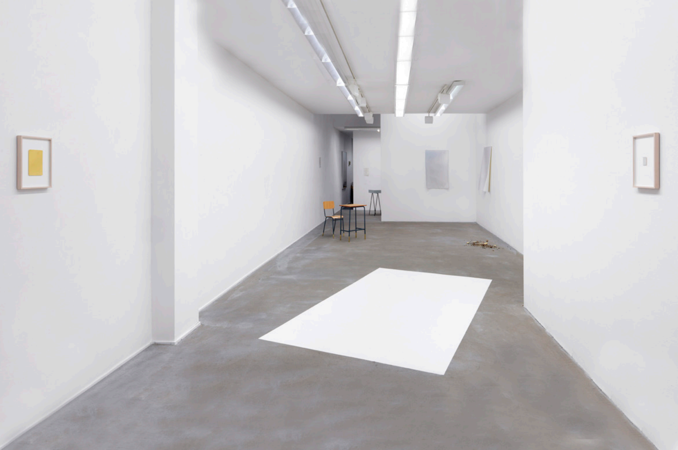
The Leaf Once Pilgrim, installation view, Akinci gallery, Amsterdam, 2016.