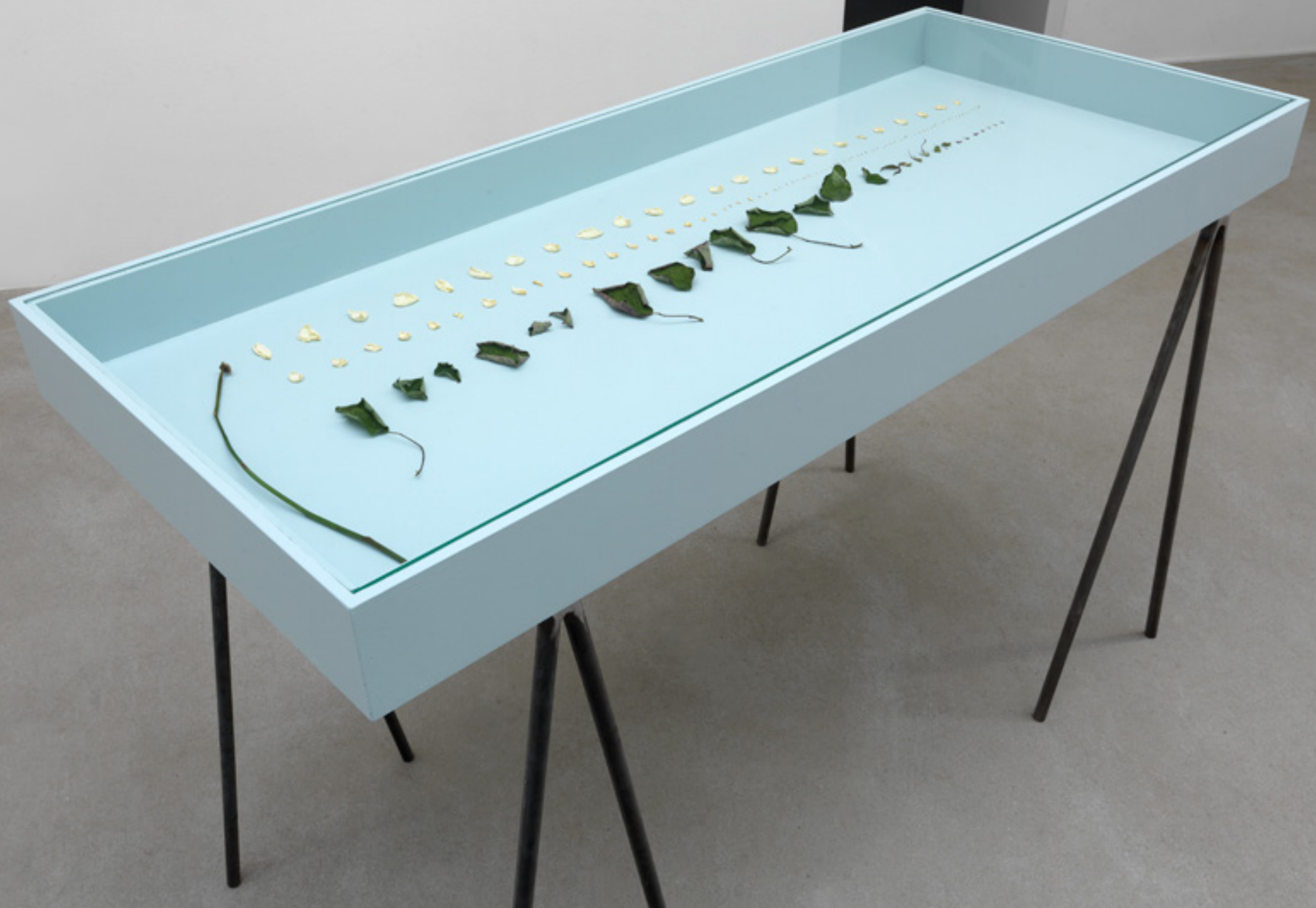
The Rose is Without Why, 2016, 20,3g, rose, vitrine: 130x50x100cm. / A rose is dismantled and its different parts placed inside a vitrine.