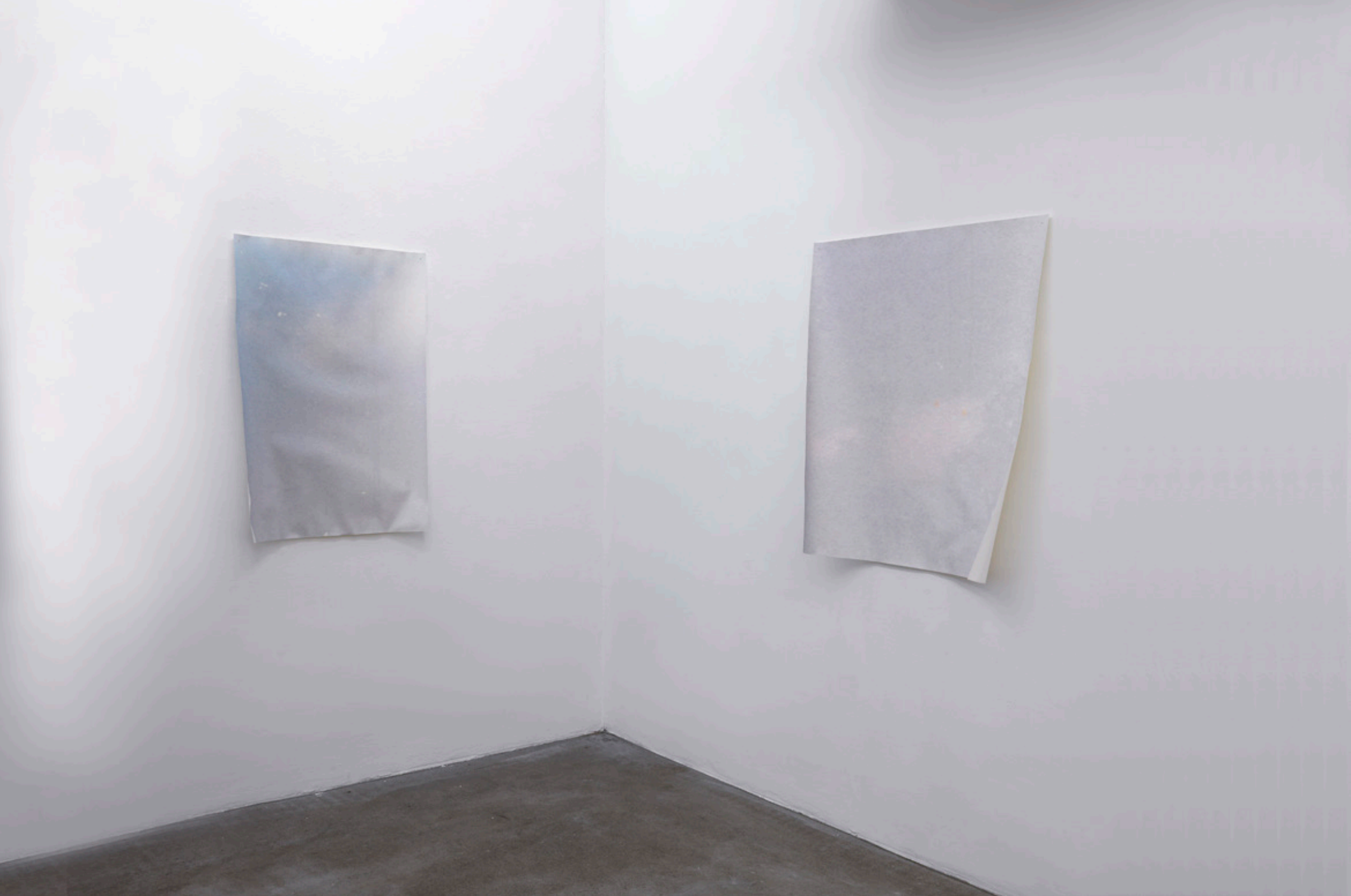
The Sky is a Village , 2016, 240g and 310g, printed photographs left outside, 115 x 78 cm and 115 x 95 cm / Pieces of sky taken from childhood photographs are scanned and enlarged to the size of the artist's studio's windows. The marks left by the rain, wind and air reactivate them today.