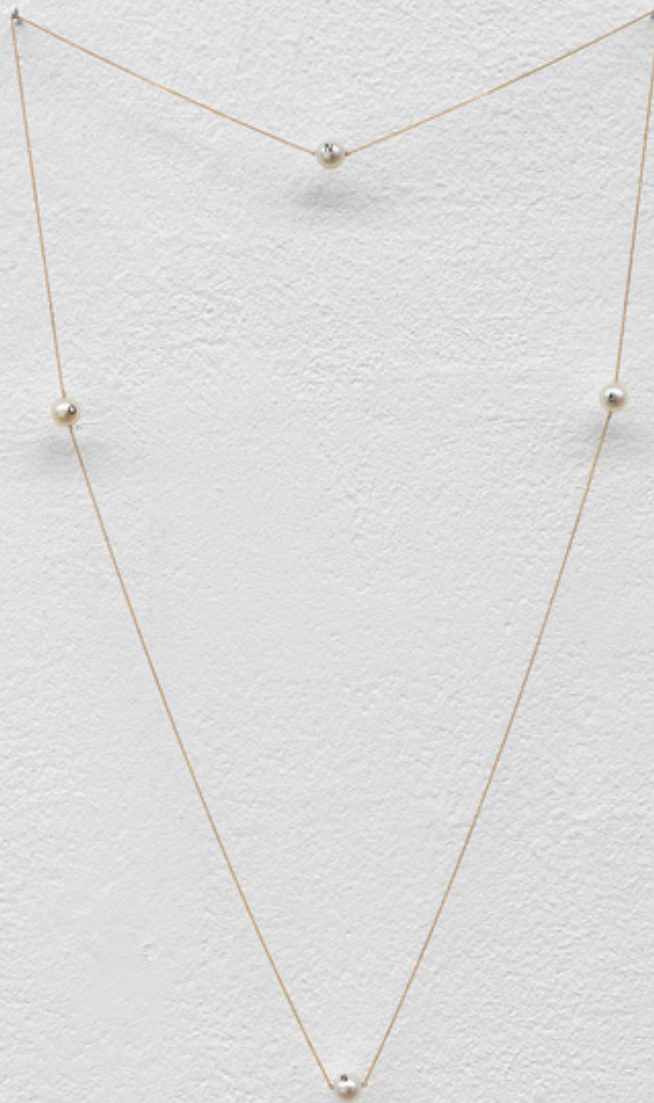
N-S-E-O-, 2015, 7,3g, gold chain, pearls, acrylic, length: 90cm. / A necklace is composed of a gold chain and four pearls, inscribed with the letters N, S, E and O: North, South, East and West.