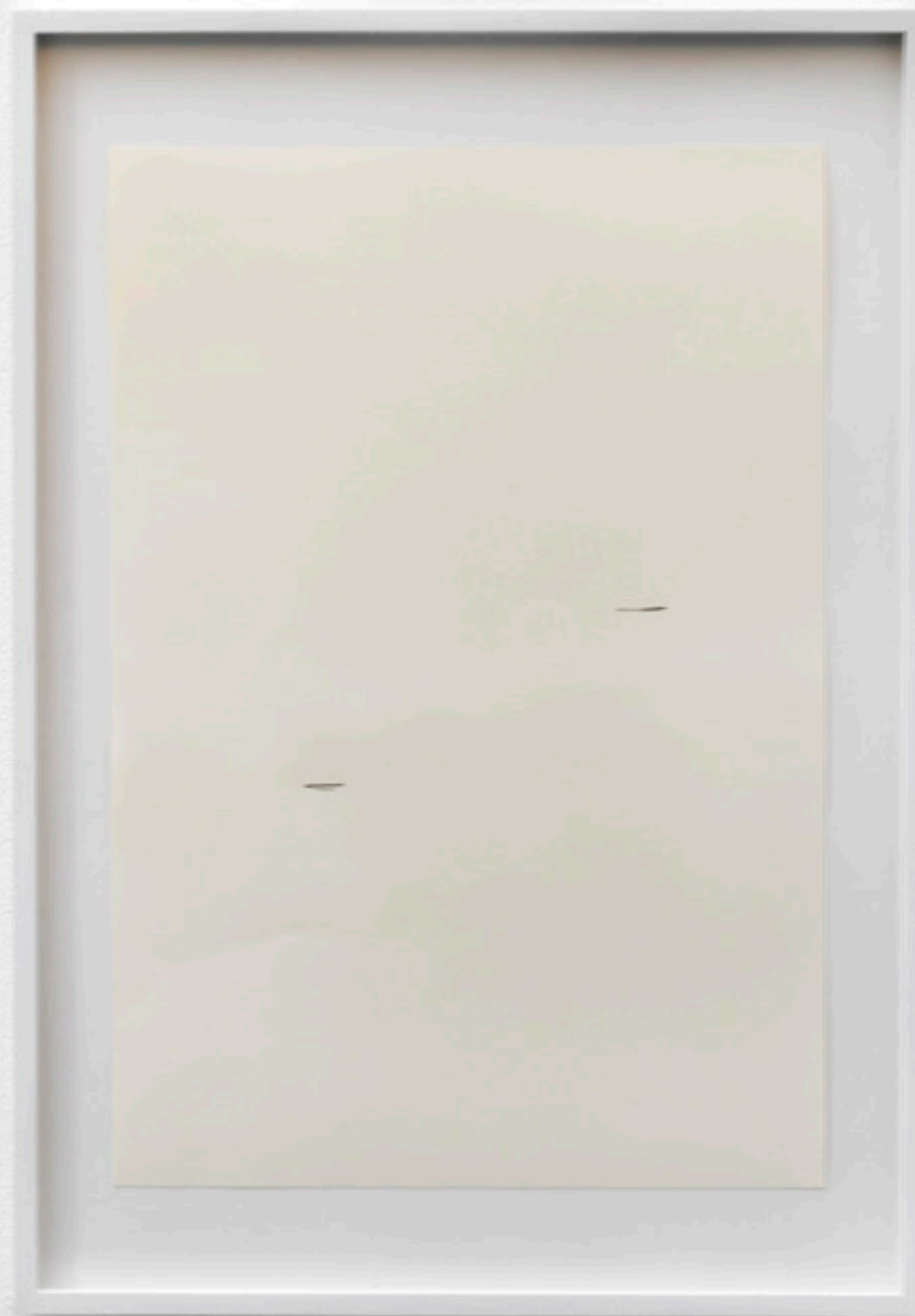
Double Altitude , 2016, g 21,21g, raphite on paper, 27x40cm. / Two lines, corresponding to the height of the artist, and her height when she is standing on the tip of her toes, are drawn side by side on a sheet of paper.