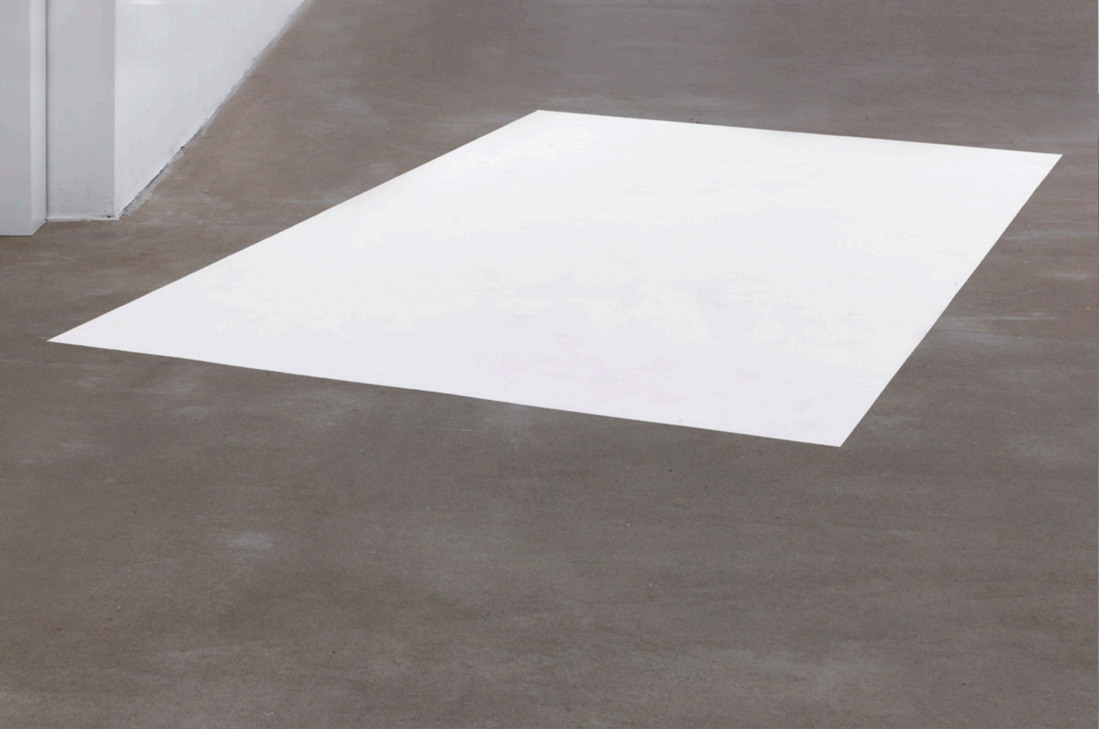
Wall Piece, 2016, 3.500 gr, plaster, paint, 200 x 300 cm / A piece of the floor is smoothened and painted white like the walls of the gallery.