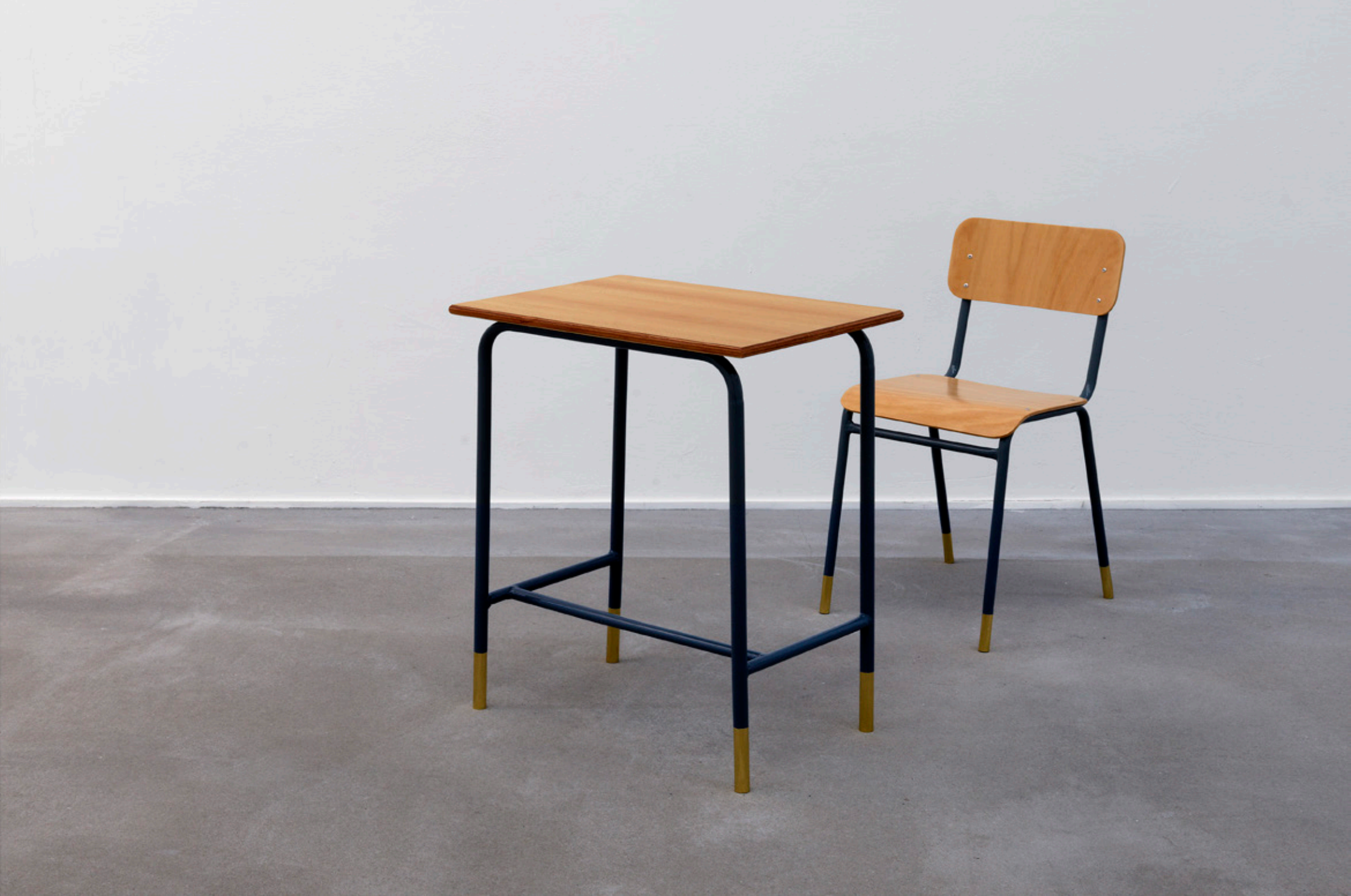
The Shape of Distance , 2016, 11.000g, pupil table and chair, welded brass, table: 77 x 40 x 55 cm, chair: 80 x 45 x 36 cm / Brass extensions are welded onto the feet of a pupil's table and chair, making them as high as an adult's table and chair.