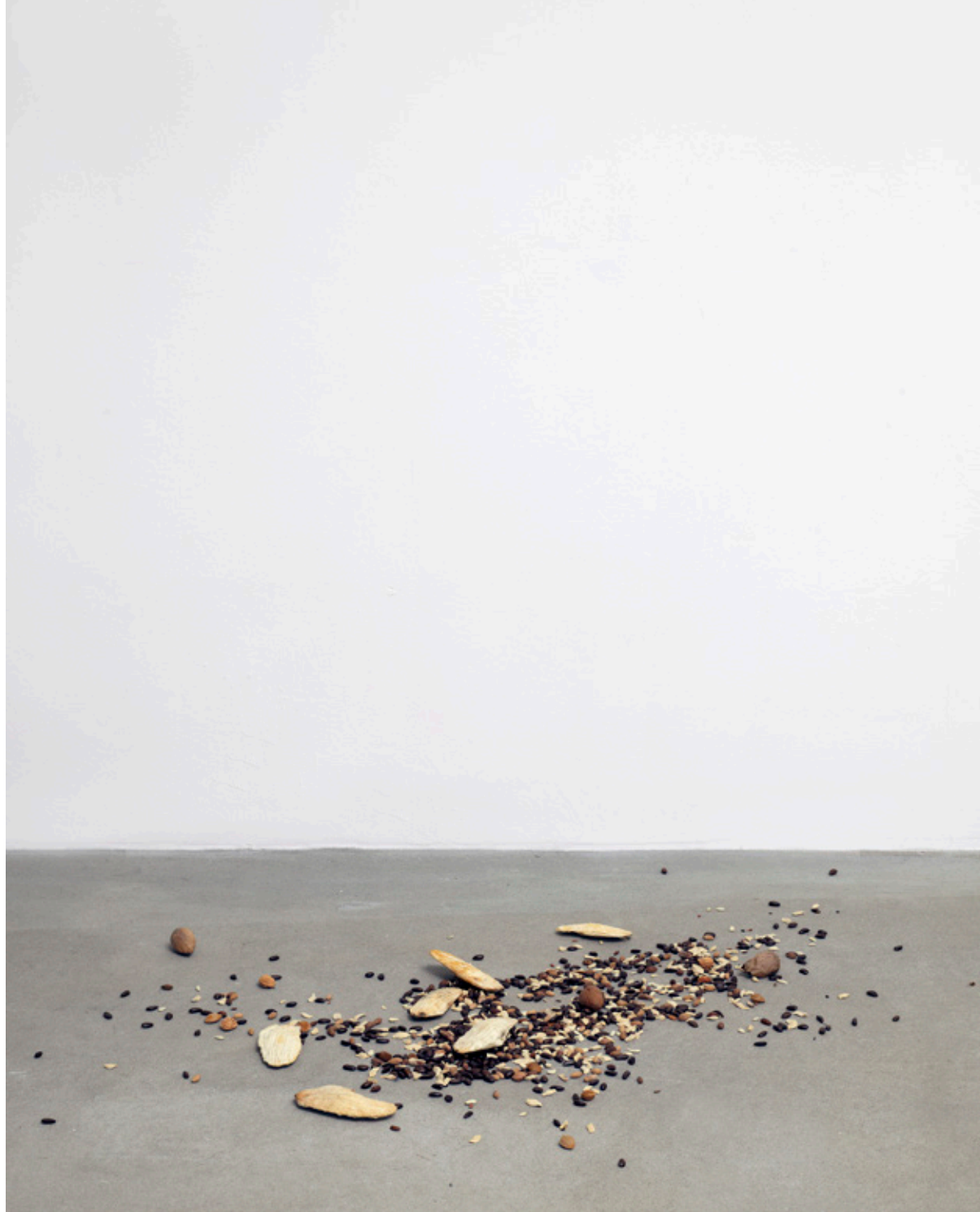
Paradise in Process , 2016, 1500,25g, surface covered with the seeds and kernels of eaten fruits, around 100x70cm / The seeds and kernels of eaten fruits, usually spit and thrown, are collected and disposed on the floor of the gallery.